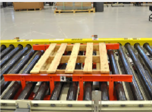
Pallet Lifter Conveyors

Vertical Hoist/Pallet lifter conveyors are used to transport products between multiple levels with speed and care. It doesn't matter if loads are packaged or unpackaged, soft or rigid, the "Modular Conveyor Express" Vertical lifter Conveyors deliver reliability and high performance.