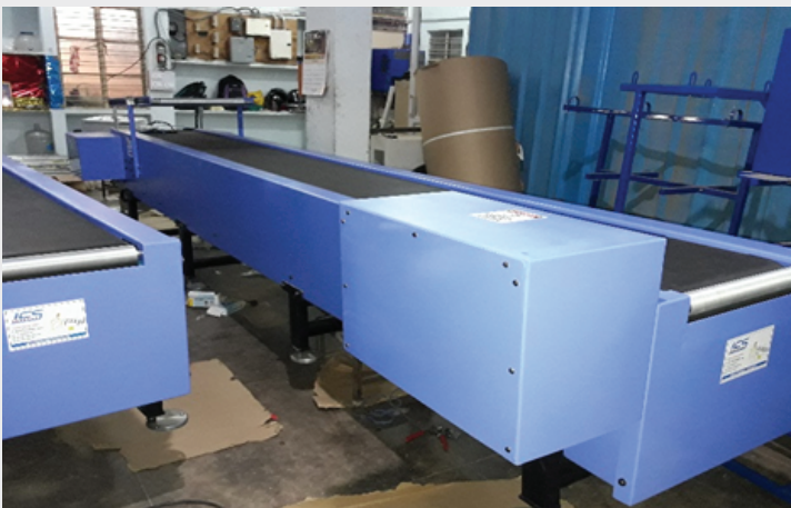
Rubber Belt Telescopic Conveyor

Telescopic mechanism that extends and retracts, allowing it to reach deep into trucks, trailers, or containers to load or unload goods quickly and efficiently.