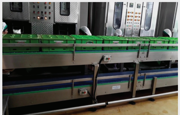
Double Decker Conveyor

Telescopic mechanism that extends and retracts, allowing it to reach deep into trucks, trailers, or containers to load or unload goods quickly and efficiently.